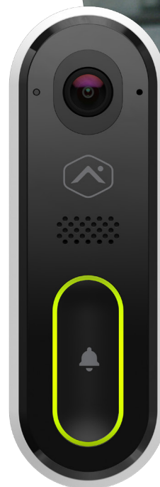
Touchless Video Doorbell (ADC-VDB770)

Keep your home and family safer with security that never stops.